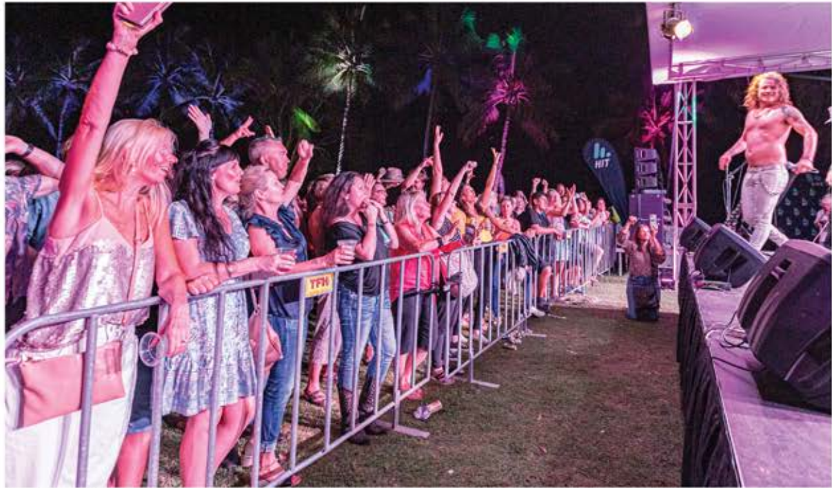
Headliners including Vanessa Amorosi and Jon Stevens promise an unforgettable weekend.

The musical festival is designed for you to enjoy the best of Port Douglas Carnivale during the day