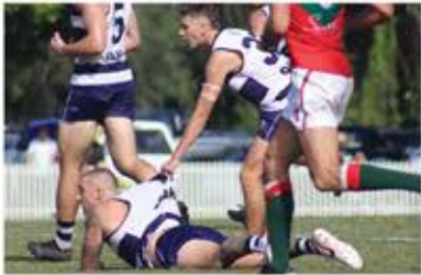
Given a hand up.