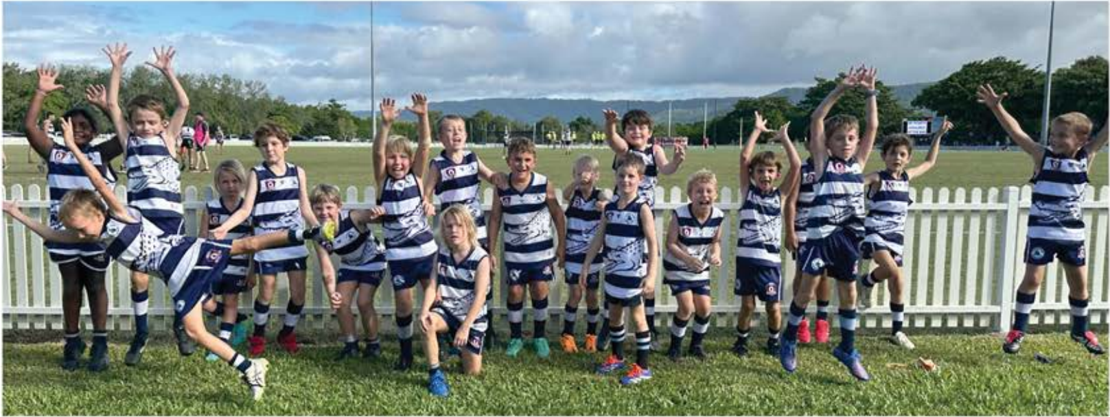
The Crocs under-8s got to play a game at half time on the day, and also had some serious fun along the way.