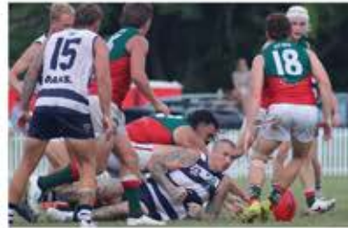
In and under.