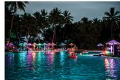
Cafe Del Mar at the Sheraton.