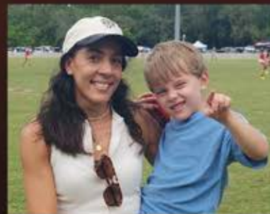
Mums kicking goals - P3