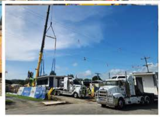
The new social housing and, inset, hoisting the top storey into place.

project was not required to meet the same guidelines as other developments.