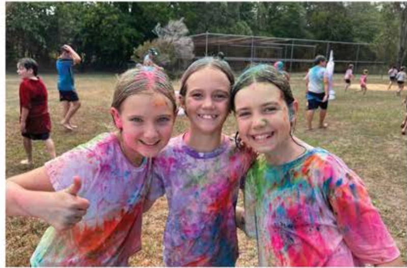
Local journalism celebrates our colourful community characters.

Public interest journalism and investigative reporting tends to be the most costly, involving extensive investment of time and re-