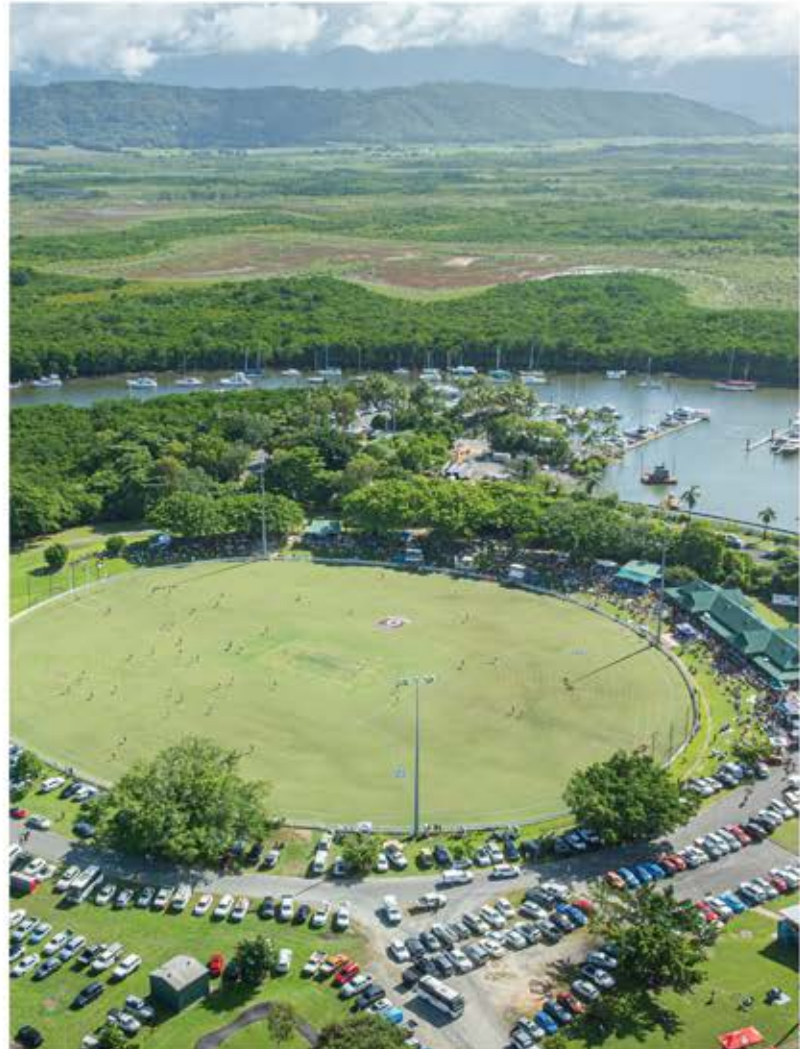
Port Douglas was looking picture perfect as a more than 3000-strong crowd flocked to see Dusty Martin and the Crocs.

All in all it was a great day for the club and fans, with everyone from the under-8s team to wheel-chair-bound seniors in the grandstand leaving with huge smiles on their beaming faces.