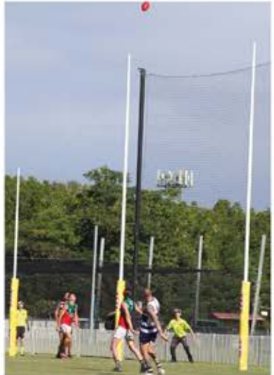
Bending one back.