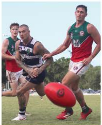
Eye on the ball.