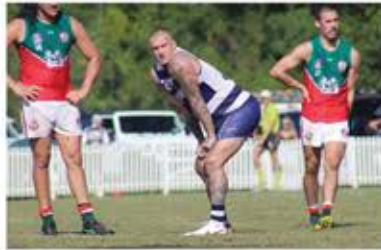
Having a rest.