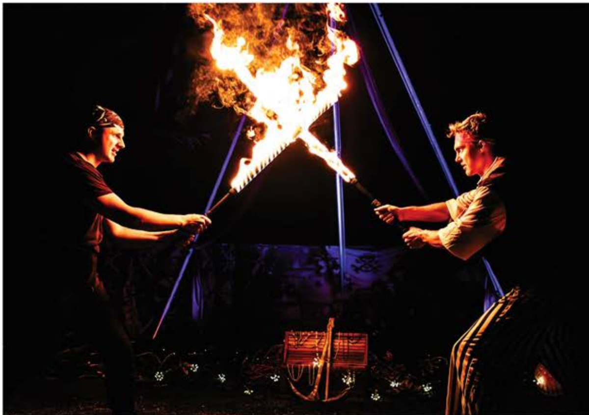
The new Sea Circus show this weekend will take you on a journey through ancient times, telling tales of mythological gods and goddesses.