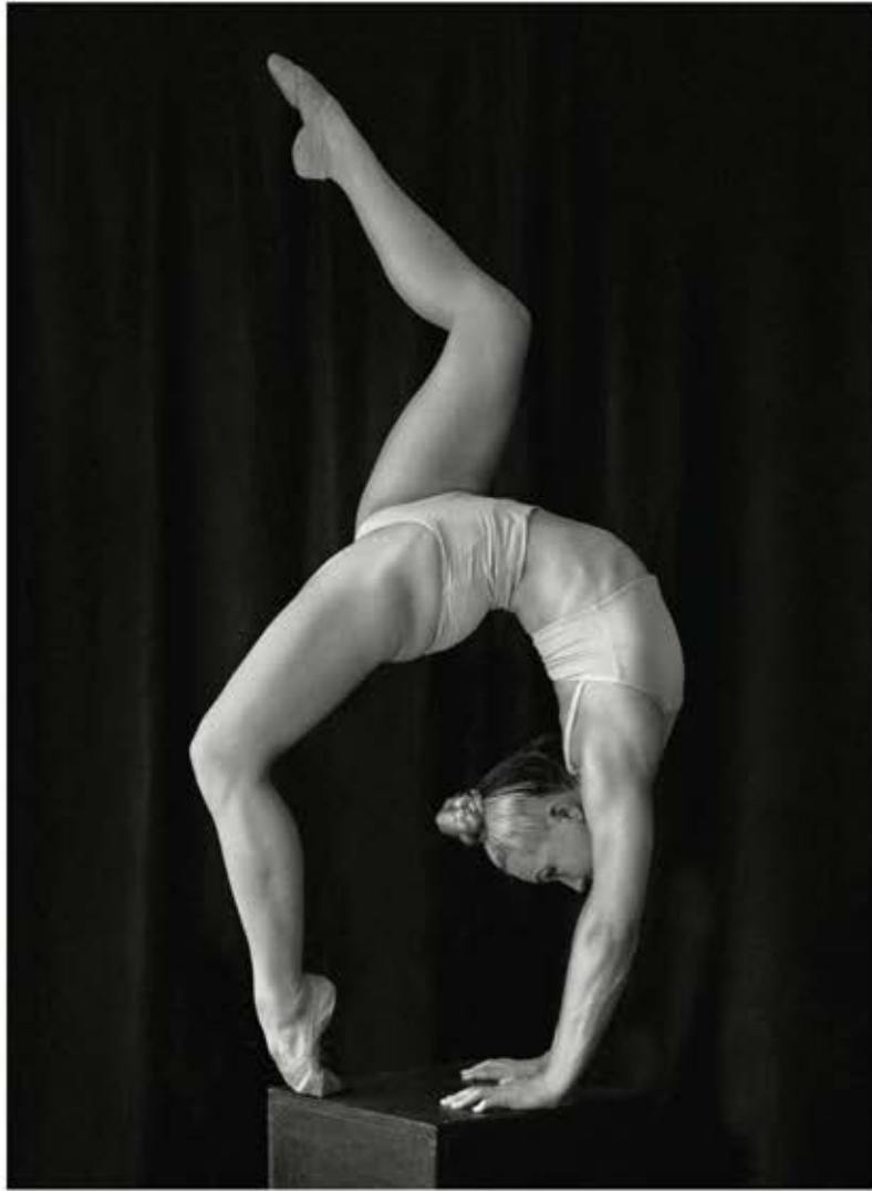
Paramour will combine circus, burlesque and family-friendly entertainment to produce a range of different shows.