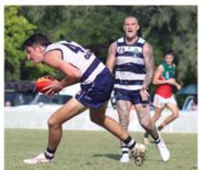
Demanding the pill.