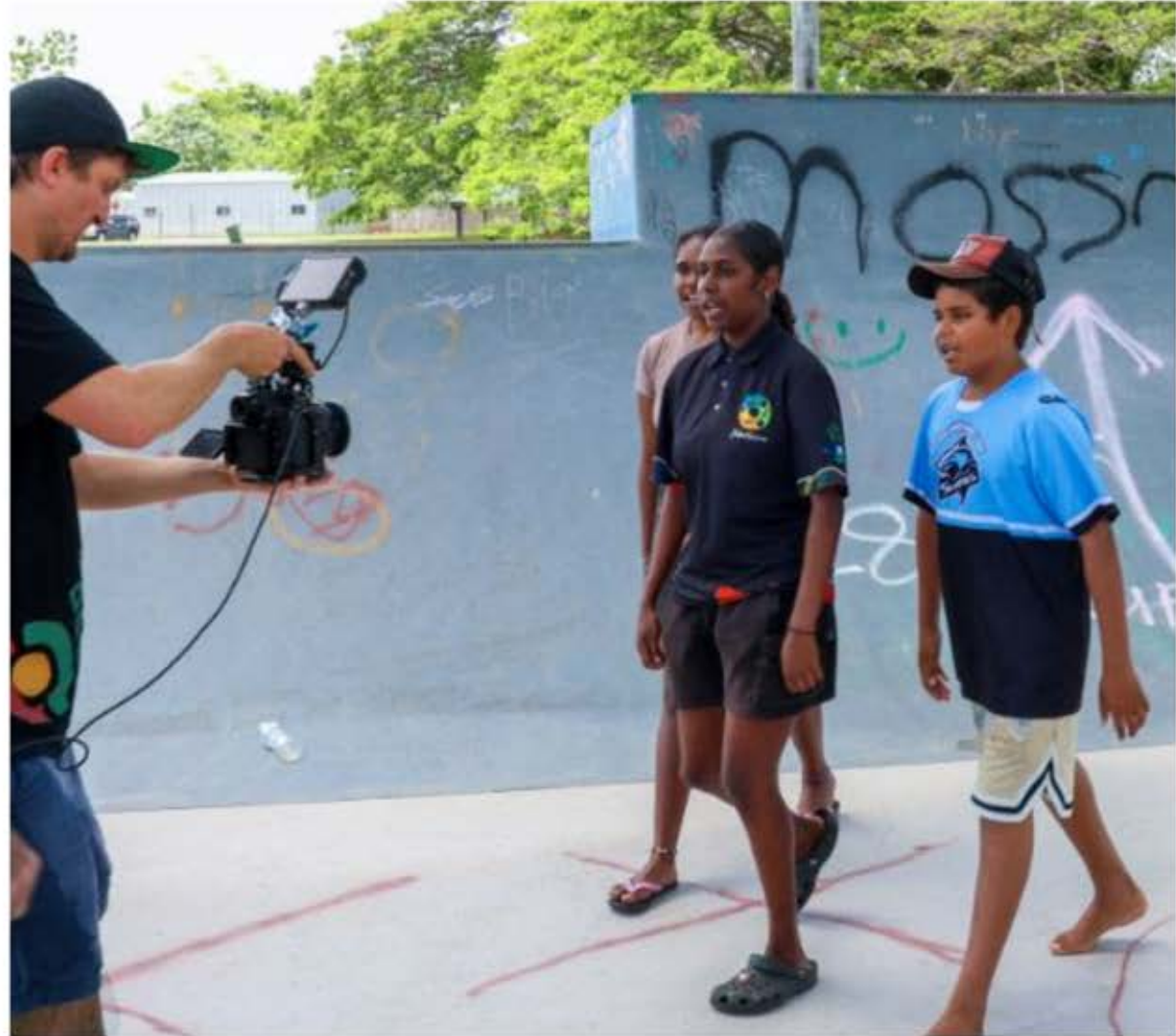
The filming of the new music video in Mossman.

The initiative is part of the Disaster Recovery Funding Arrangements initiated after Cyclone Jasper to help communities get back on their feet.