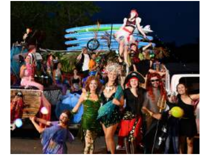
The Macrossan Street Parade on Friday night and the Family Beach Day on Saturday at Four Mile Beach were two of the most popular and colour ful events at this year's Port Douglas Carnivale.