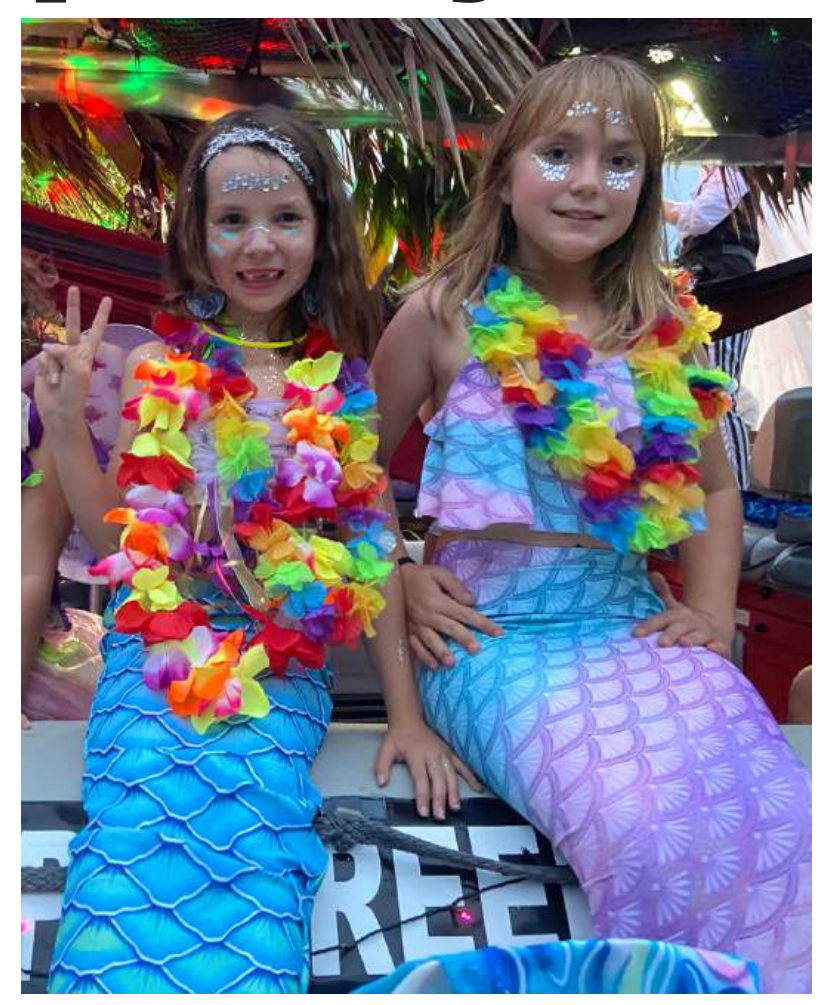
The Windswell and Sea Circus Productions float at the Macrossan Street Parade won Best Business float.