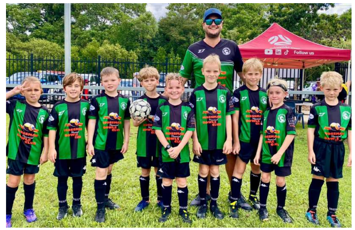
The Douglas United Dragons Under-9 team is one of four junior squads at the club.