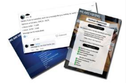
Scammers are targeting Douglas Shire job seekers.

"And then when you talk to them, you realise that the conditions and hours are ridiculous, and that you can work from home and