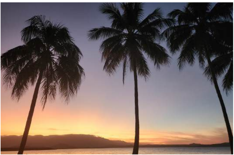
Coconut palms are a much-loved feature of Douglas Shire.

700 coconut palms across Port Douglas and Oak Beach.