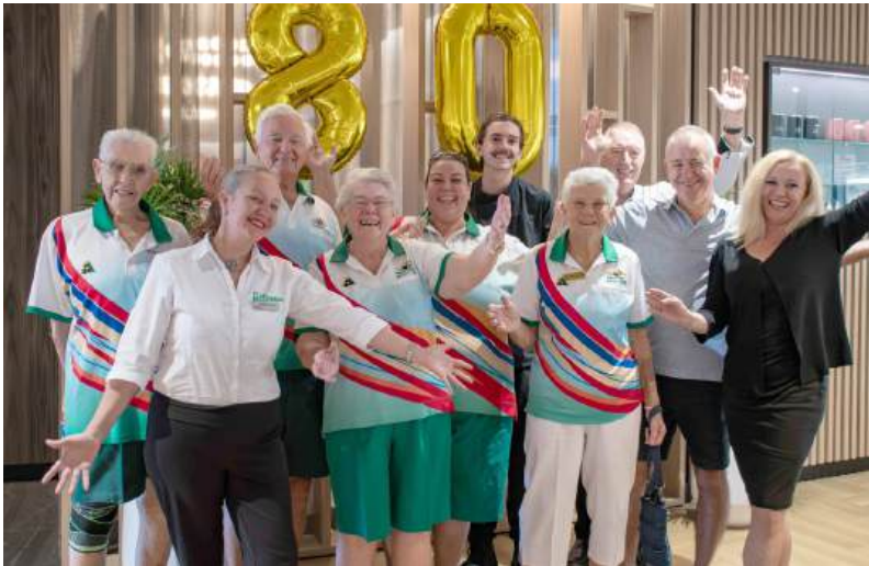
Club Mossman is celebrating 80 years.

To read the full story scan this QR code