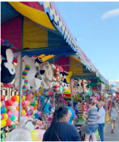
Mossman Show is on this weekend.