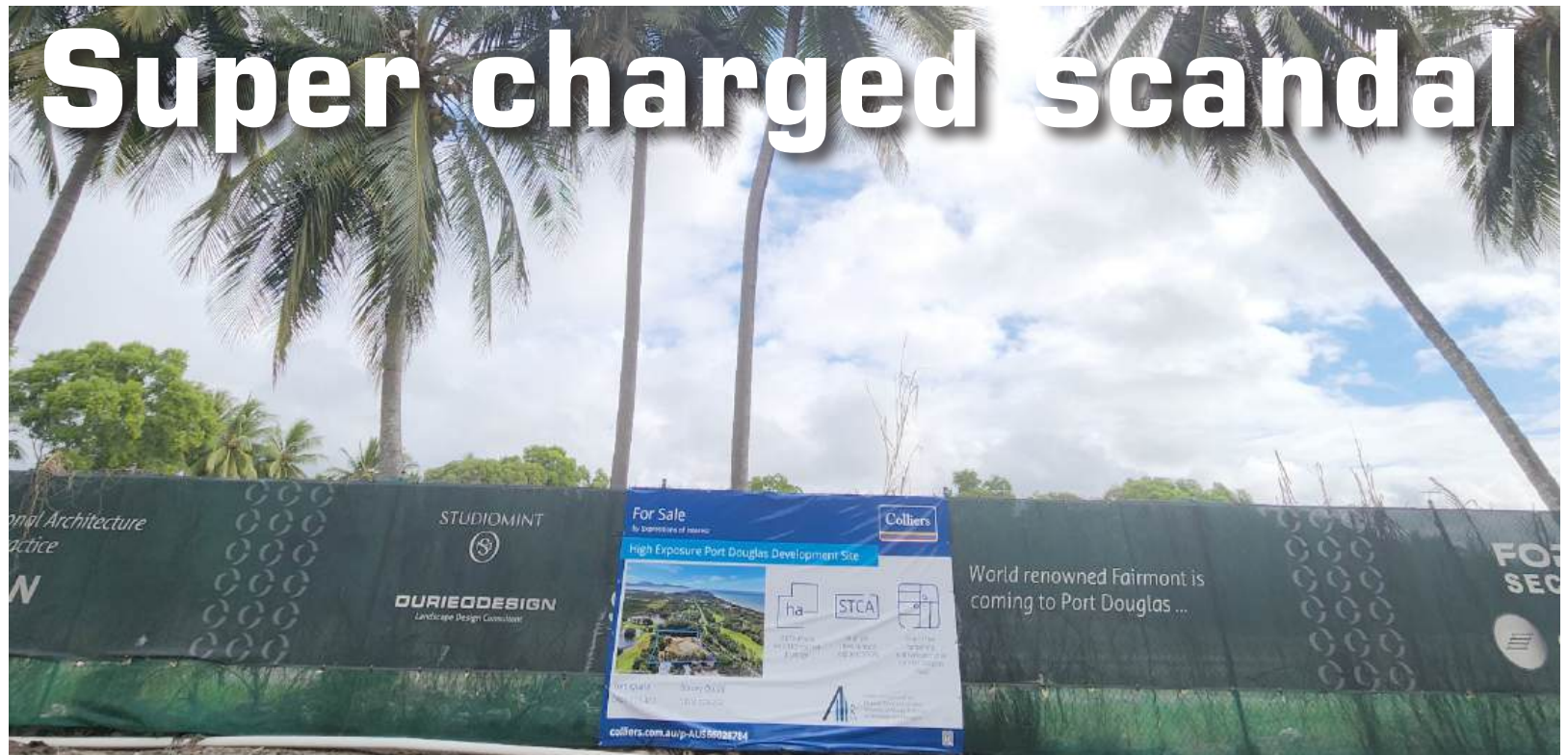
This vacant block on Port Douglas Road is integrally involved in a massive national investigation by corporate watchdog ASIC.